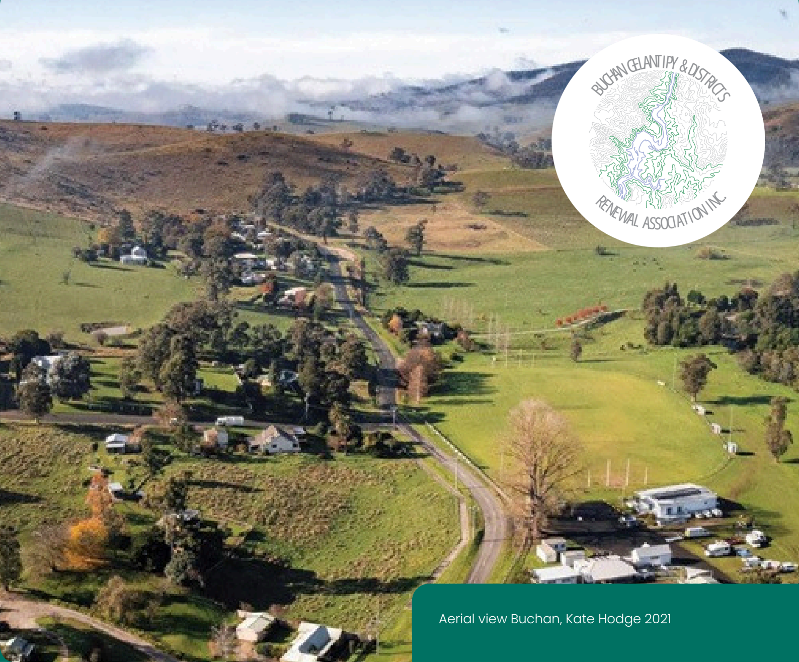
Aerial view Buchan, Kate Hodge 2021